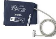
XLARGE CUFF 42-50cm HXA-GCFXL-PBE (with 1 m tube) HXA-GCFXL-PCE (with 4.5 m tube)