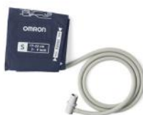
SMALL CUFF 17-22cm HXA-GCFS-PBE (with 1 m tube) HXA-GCFS-PCE (with 4.5 m tube)