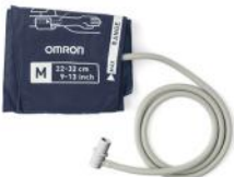
MEDIUM CUFF 22-32cm HXA-GCFM-PBE (with 1 m tube) HXA-GCFM-PCE (with 4.5 m tube)