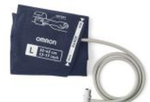
LARGE CUFF 32-42cm HXA-GCFL-PBE (with 1 m tube) HXA-GCFL-PCE (with 4.5 m tube)