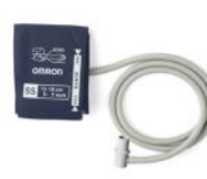
XSMALL CUFF 12-18cm HXA-GCFXS-PBE (with 1 m tube) HXA-GCFXS-PCE (with 4.5 m tube)