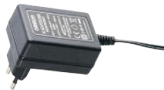
AC ADAPTER-E1600 AC ADAPTER-UK1600