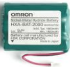
BATTERY PACK HXA-BAT-2000